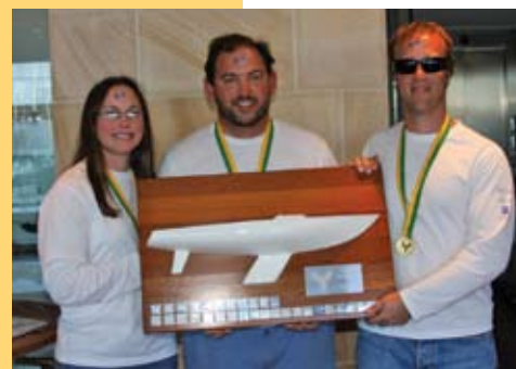
AUS 60 winners of the Australian Yngling National Championship 2010