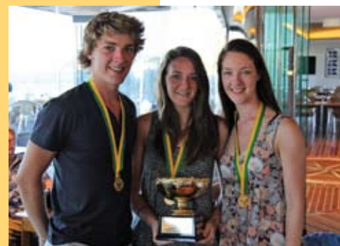
AUS 39 Winners of the Yngling Gold Cup 2010 for Youth