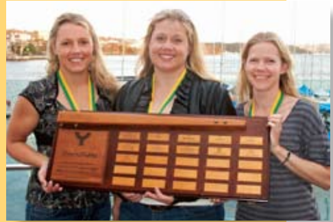
AUS 19 Winners of the Sirocco Trophy for best female team